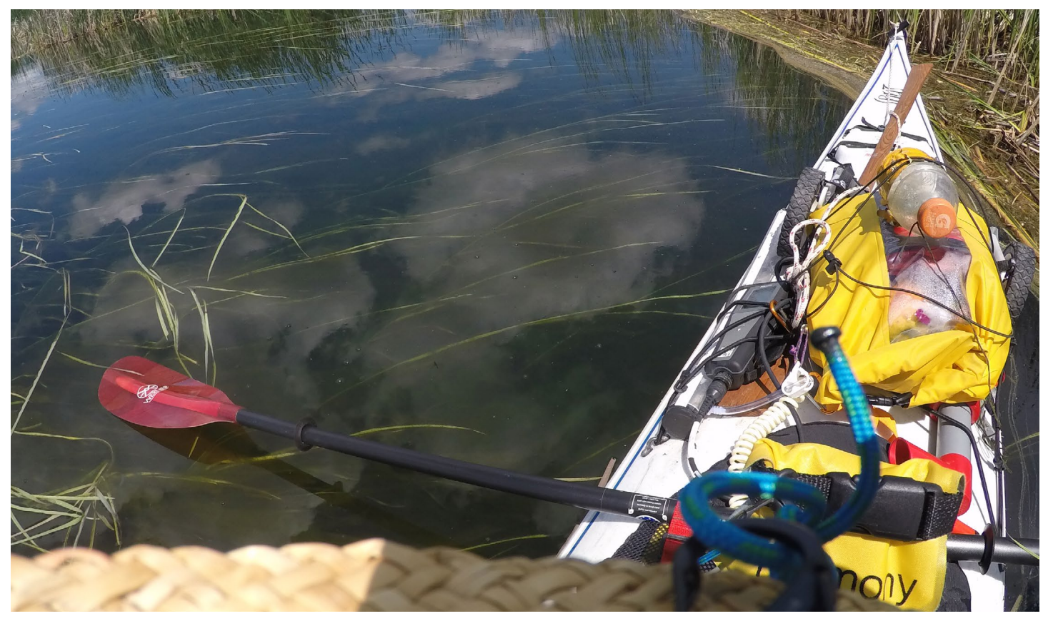
Pohl's view during her trip down the Mississippi River.

The Mississippi River runs approximately 2300 miles, and Pohl took the Atchafalaya (the "Old Mississippi River") route to the Gulf of Mexico. Water quality measurements were taken approximately every 12 miles. Location was noted with a GPS unit. Water samples were tested from a kayak, at or near the center of the stream. The river varies from several feet wide and only a few inches deep to four miles wide and up to 200 feet deep.